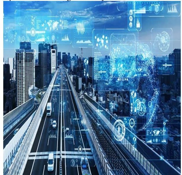
Fig 3: AI based traffic view

provides valuable user perspectives, while simulation results offer insights into system optimization. The section also addresses system reliability, cost-effectiveness, and future prospects for enhancing scalability and effectiveness.